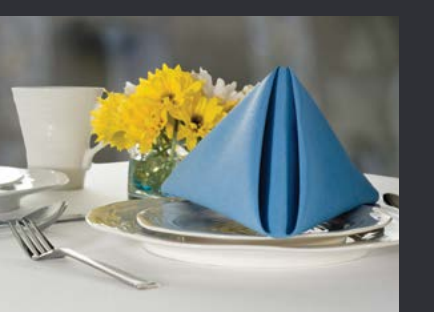
table linen fabric made solely in the United States.

Milliken & Company has been named to the "2014 World's Most Ethical Companies" list by the Ethisphere® Institute. This marks the eighth consecutive year the list has been published and Milliken is honored to have made the list each time. Read more on milliken.com in the company's news and media section.